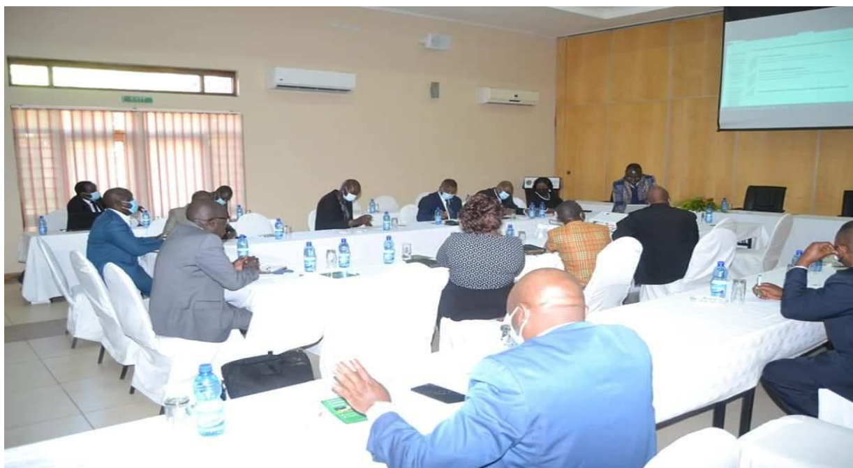
Participants listening to a presentation during security agencies joint meeting with MANEB officials

In August a cross section of stakeholders among them District Directors of Education, Youth and Sports, Education Division Managers, City Assemblies, Private Schools, Teachers Unions met with MANEB officials to share notes on preparations for administration of the 2021 examinations. All stakeholders meetings were fruitful and MANEB was assured full support.