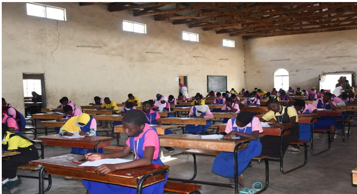
Candidates writing PSLCE examinations