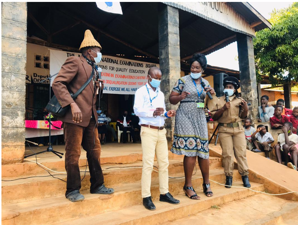
MANEB dramatists during one of their performances at Nyungwe Primary school

The awareness campaigns continued throughout the examinations period through radio programs and jingles which centred on several issues among them roles of examination administrators, candidate code of conduct, reporting examination malpractices and use of the toll free line.