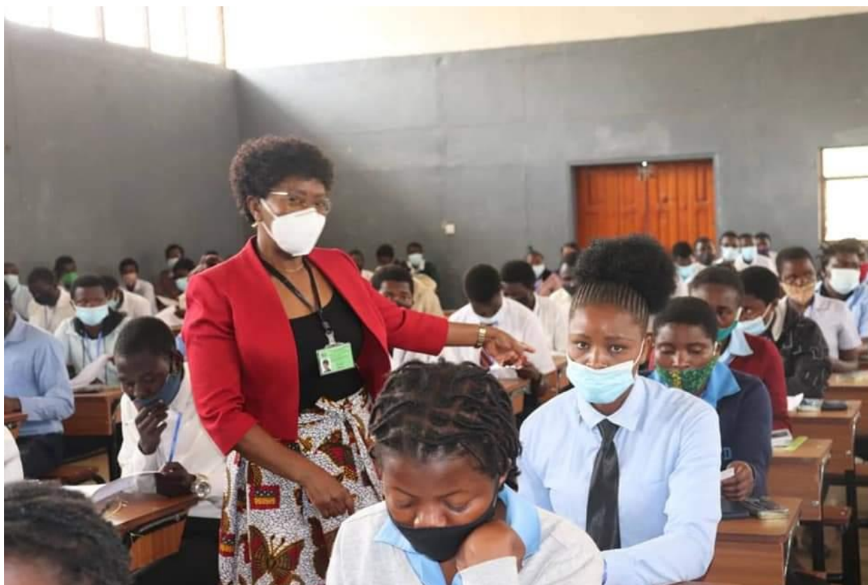
Minister of Education, Honourable Agnes NyaLonje monitoring administration of MSCE examinations